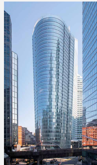
Tour Alto 2-8 Boulevard de Neuilly 7 Place des Saisons 92400 Courbevoie

For more information, check our website: www.i2en.fr/en/events/